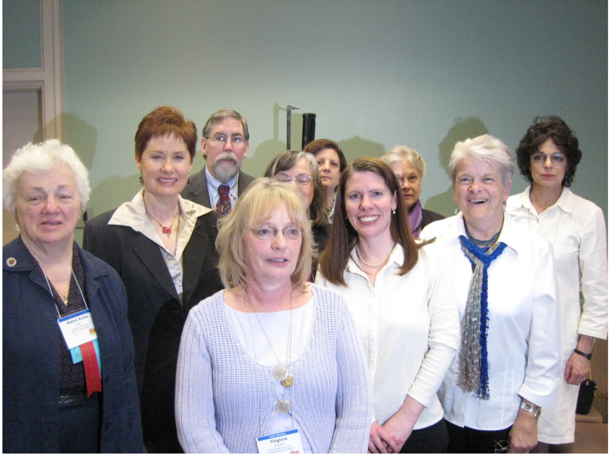
This was the 25 th anniversary of the Research award and several past award winners were on hand to celebrate this milestone.