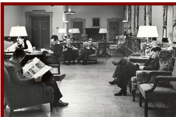
Periodicals Room, Rose Library Drew University, 1950s