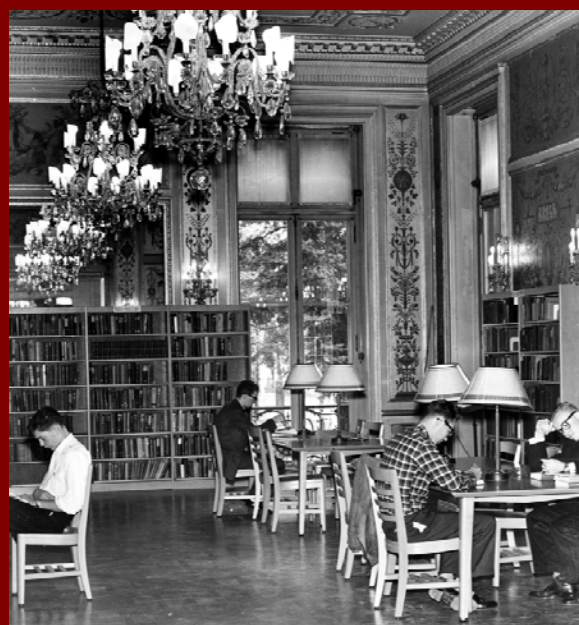
Reading Room Monmouth University Library, 1950s