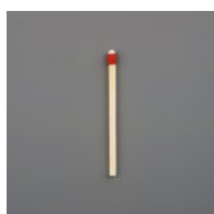
Strike Anywhere Aspen wood, wax, gelatin, pigment, chemicals Zoe Sheehan Saldana 2007

The main accompanying exhibition will run November 7, 2008—January 23, 2009 . A secondary accompanying exhibition will run November 7th—December 20, 2008 .