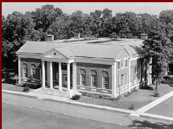
The College of New Jersey Roscoe L. West Library 1940s