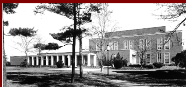
Rutgers University Alexander Library, built in 1956

To learn more about the free downloadable Toolbar, and to place a LibX Toolbar on your browser, please see: http://www.libraries.rutgers.edu/rul/tools/toolbar/toolbar.shtml . If you have questions or comments about the Rutgers University Libraries LibX Toolbar, please send an email to RUL_toolbar@email.rutgers.edu .