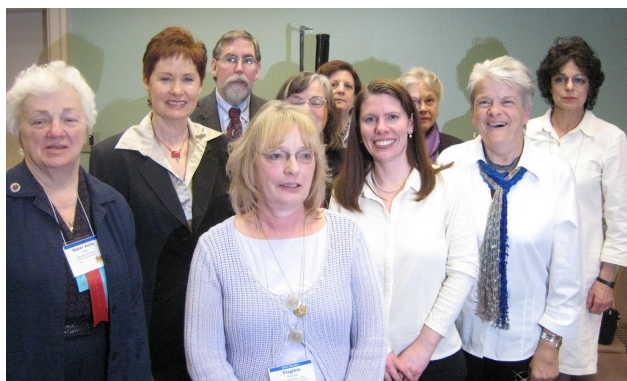
Past and current winners of the Research Award